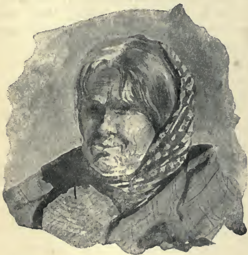
THE GREY-HAIRED WOMAN

Miss Bennett laughed a very little. I was glad to see her laugh; it had struck me her face was strangely haggard and frightened.